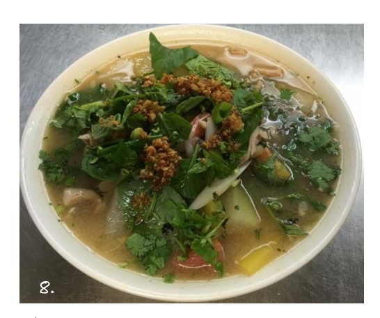
★ Featured in <u>The New York Times</u> July 6, 2016